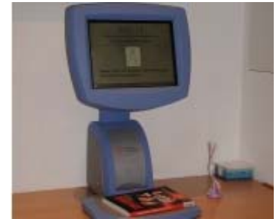
Staffs are able to borrow any items without bothering the librarian