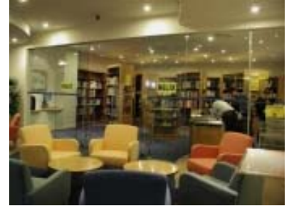
Thoughtfully designed, ELiMS ® is able to blend into any environment