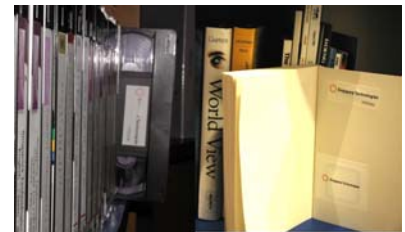
All library materials could be managed using the same process – Single User Interface