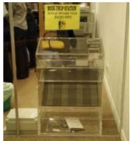
Locating just outside the library, staffs can now return materials even when the library closes.