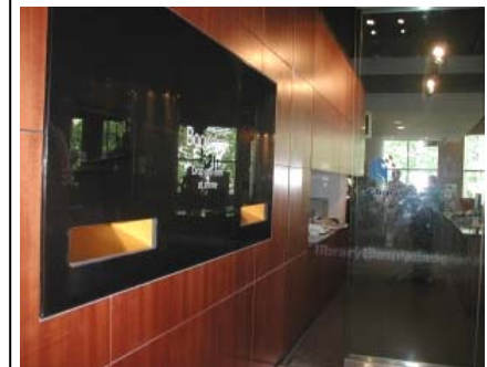
Outside library and operating 24hrs, patron may now return books after a drama