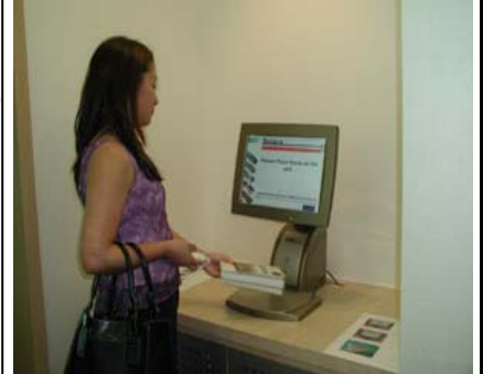
Patrons loan and return items on their own