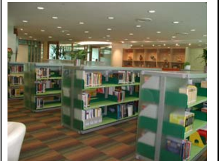
Staffs are freed from routine work