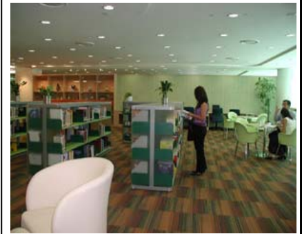
A conducive environment for the members