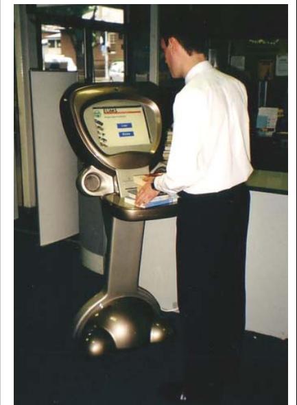
Patron of BHSC may now borrow library materials all by themselves