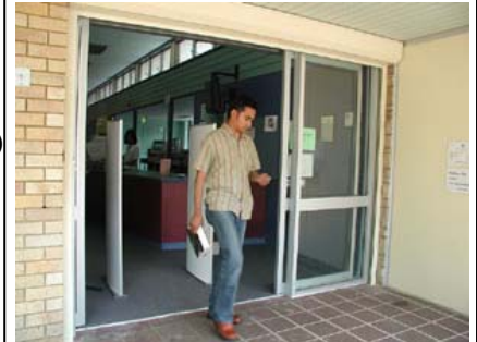
ELiMS® Security Gantry safeguards all library materials