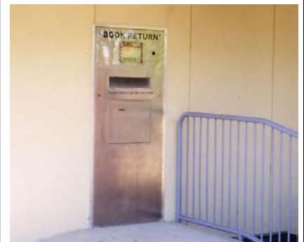
Outside library and operating 24hrs, patron may now return books even after operating hours