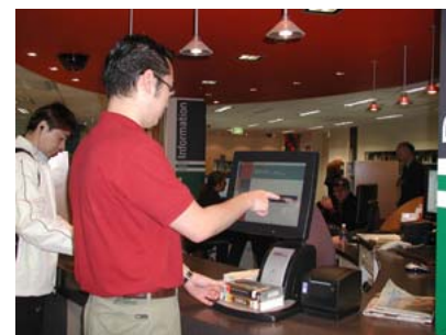
Patrons loan items on their own