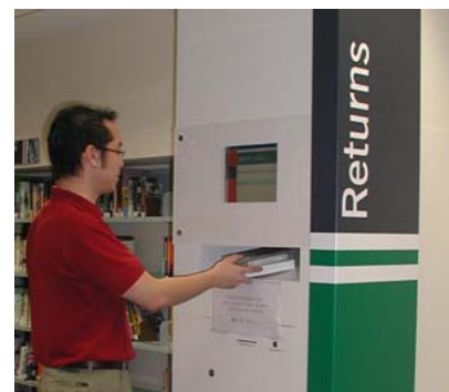
ELiMS® Book Drop allows only valid items to be returned