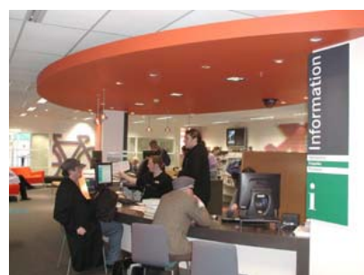
Staffs are freed from mundane work for better services to patrons