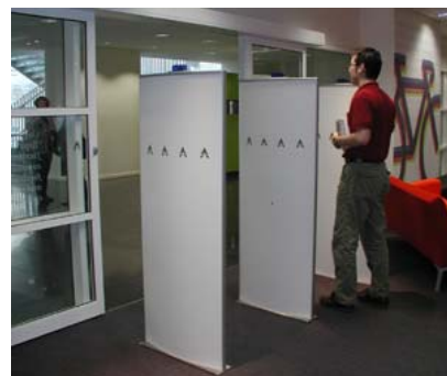
Patrons can return item and have their loan cancelled in any time of the day